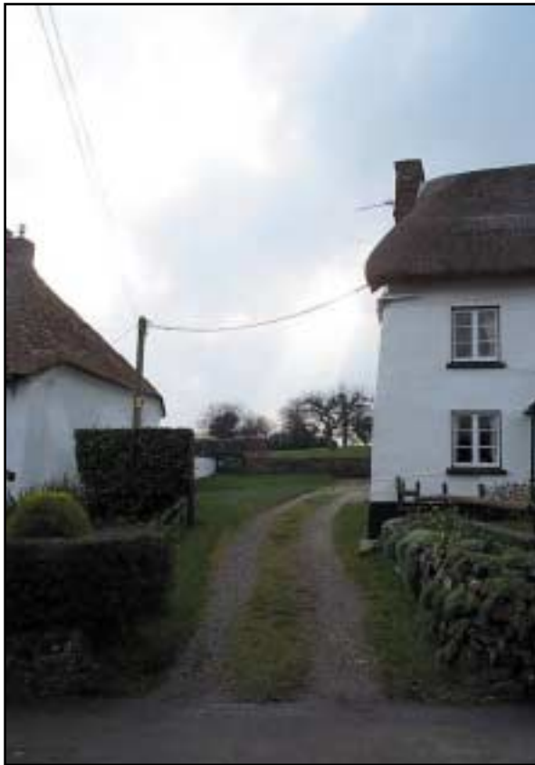
Fig 25 The view of the village centre from the bus stop