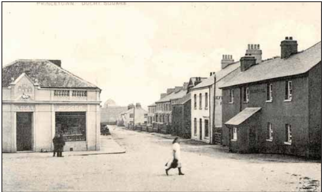
Figure 1 Duchy Square, Princetown