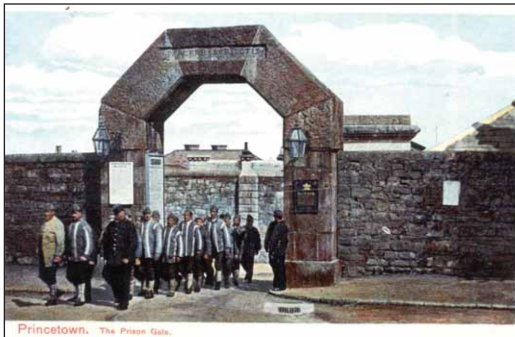
Figure 3 Gateway entrance to Dartmoor Prison, Princetown