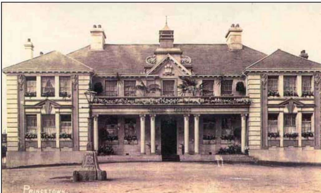
Figure 2 Duchy Hotel, Princetown