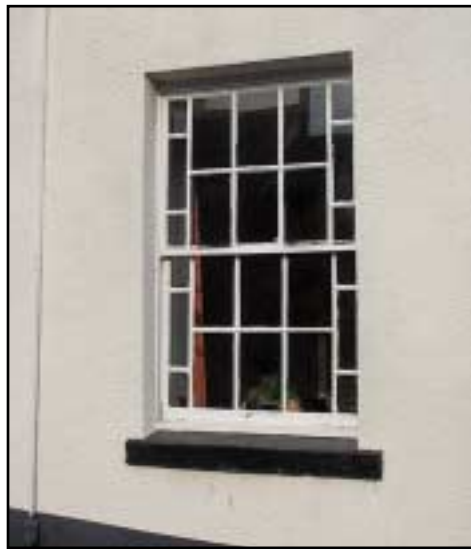
Fig 2 An early 19th century casement window