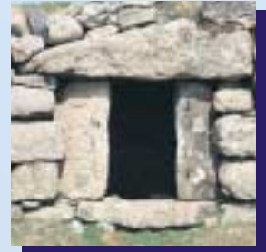
Dartmoor granite has been utilised for human uses for millennia