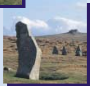
Prehistoric stone circle, Scorhill