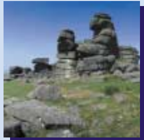
Staple Tor