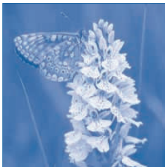
Heath spotted orchid and marsh fritillary